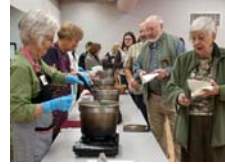
2011 Empty Bowls fundraiser in Burien, WA